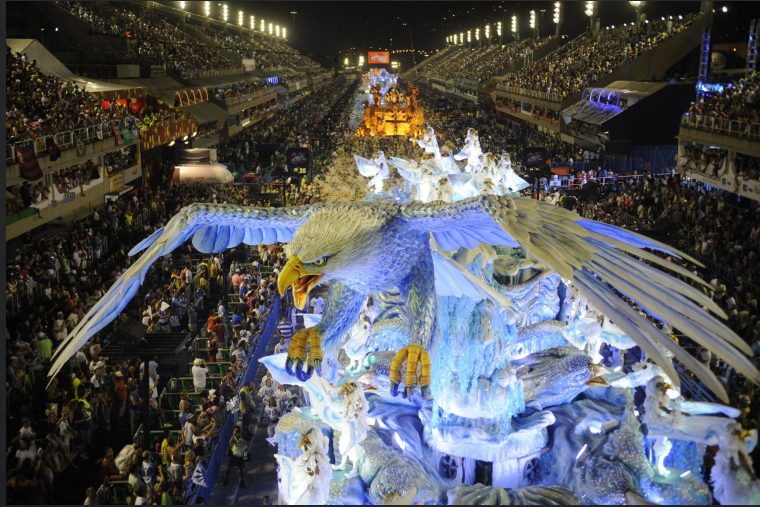
The Carnival of Brazil (Afternoon, February 17 – midday, February 22)