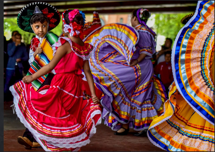
Cinco de Mayo (México) Friday, May 5, 2023