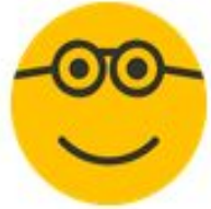
Ready to Learn